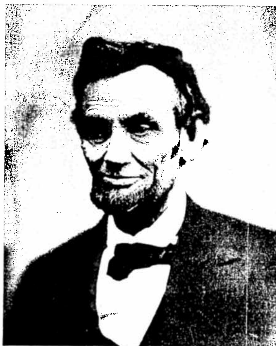
10, 1865.

the "great offense" of slavery, as a terrible retribution God had visited on a guilty people, in North as well as South. Lincoln's vision was close to that of old John Brown, who had prophesied on the day he was hanged, on that balmy December day back in 1859, that the crime of slavery could not be purged away from this guilty land except by blood. Now, in his second Inaugural Address, Lincoln too contended that God perhaps had willed this "mighty scourge of War" on the United States, "until all the wealth piled by the bondman's two hundred and fifty years of unrequited toil shall be sunk, and until every drop of blood drawn with the lash, shall be paid by another drawn from the sword."