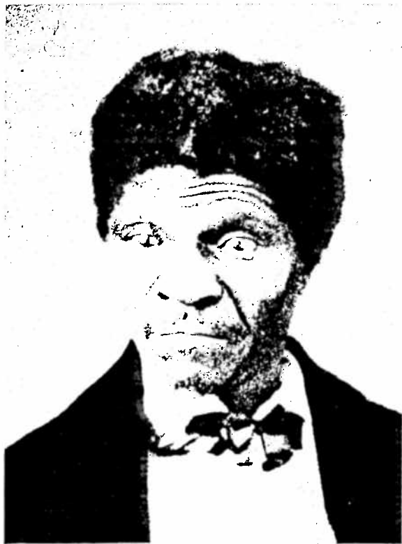
Dred Scott in 1858, a year after the Supreme Court decision that bore his name. Originally called Sam, Dred Scott, a slave, sought his freedom on the grounds that he had lived for a time in a free state and a free territory. His case led to one of the most infamous Supreme Court decisions in American judicial history. Bought and freed by a white benefactor in 1857, Scott became a porter at a St. Louis hotel and died in 1858.

since the Revolution of 1776 would be obliterated. The world's best hope—America's experiment in popular government—would be destroyed, and mankind would spin backward into feudalism.